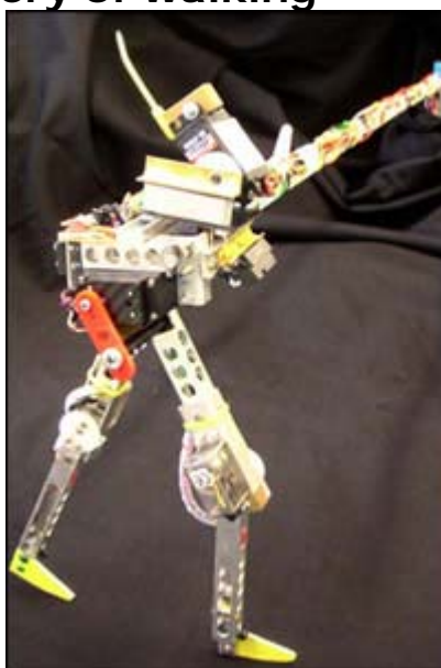
Runbot can adapt to changes in the terrain

Information from sensors is constantly created by the interaction of the robot with the terrain so that RunBot can adjust its step if there is a change in the environment.